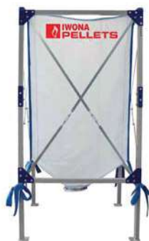
Tank of material 1400 kg