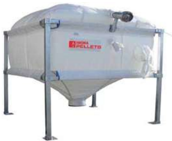
Tank of material 2400-7600 kg